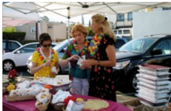
Taste of Larchmont 2009

Clothing is also distributed as supply allows at Wilshire Christian pantry and Immanuel Presbyterian pantry.